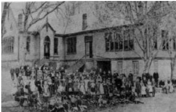
Stockton School- Built 1872

In 1871 the State of New Jersey passed an act that made all public schools free.