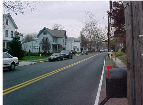
Route 29 in Stockton

In the 2008-2009 school year, Stockton Borough School began using a theme to integrate different subjects throughout the year and to provide practical applications for lessons. The first year, this theme was “Helping the Planet: One Step at a Time,” and alternative transportation modes played a key role in a number of lessons.